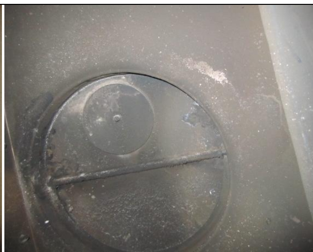
This shows a damper in the closed position. Flue gasses will not exit the firebox.