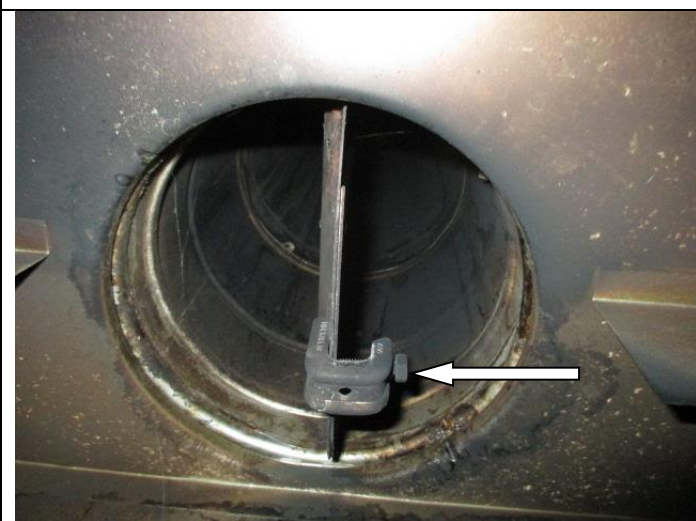
This shows a damper lock installed and the flue in the open position.