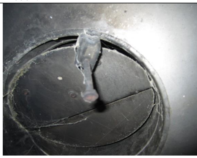
This shows a damper lock installed and the flue in a closed position; note the gap which will allow gas or other combustion byproducts to safely exit the firebox and up the flue.