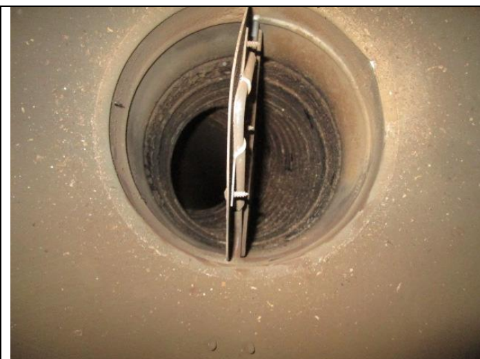
This shows a damper in the open position. Adequate ventilation for flue gasses.