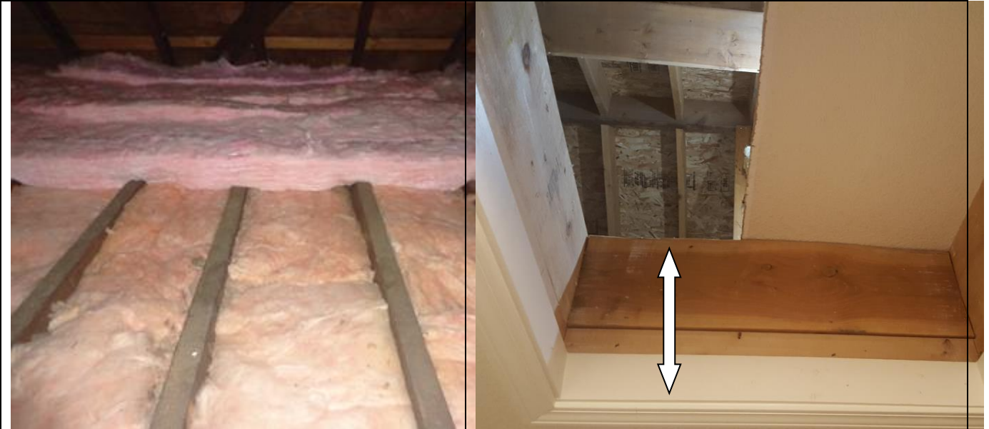
This shows how to place two layers of batt insulation.

If you plan to use fiberglass batt insulation begin by cutting long strips and lay them in between the joists. Do not bunch or compress the material; this will reduce the insulating quality. When installing the second layer of insulation place it perpendicular to the first layer to help minimize air leakage by ‘short circuiting’ or air leakage between the joist and the insulation.