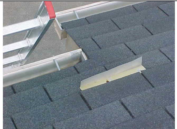
Overlap kickout installed.