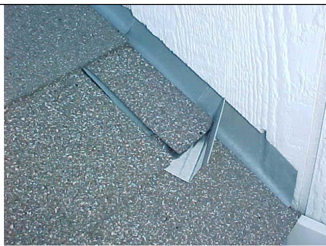
Higher roof line kickout installed.