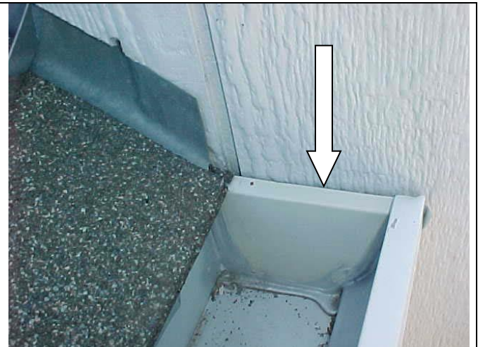
Close-up view showing where water can seep between the gutter and siding.

The simplest way to divert the water away from the siding, chimney or other location is to cut a piece of “L” shaped drip edge with tin snips. We recommend a minimum of 4 inches, however longer sections are easier to install as they allow for more surface area under the shingle. You can cut the kickout in a variety of shapes to fit your specific configuration. Below are a few photos of drip edge being cut and installed. The drip edge costs approximately $3.00 for 10 feet. It cuts easily with tin snips and can be slid under the first shingle tab. After the first hot day, the tar under the shingle should self-seal to the drip edge; if it does not and the drip edge comes loose you can use roofing tar to secure it in place.