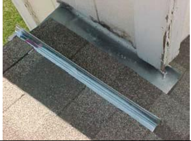
Chimney kickout installed.