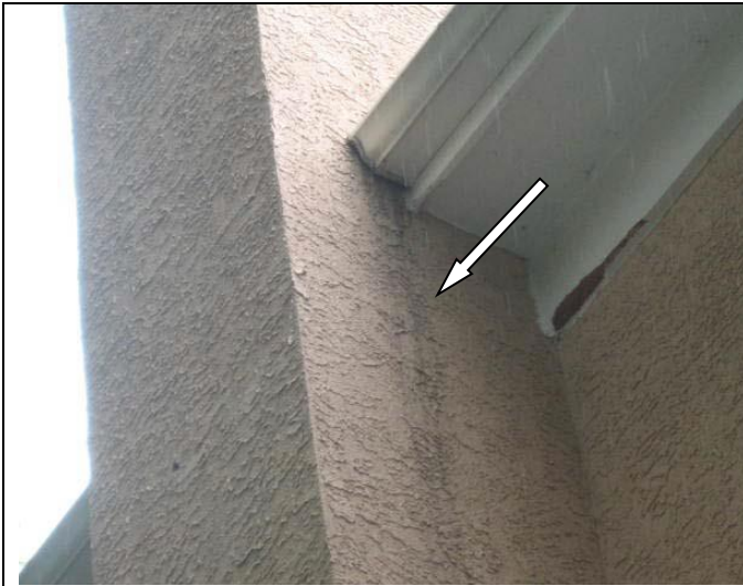
Water staining, prior to any significant damage.