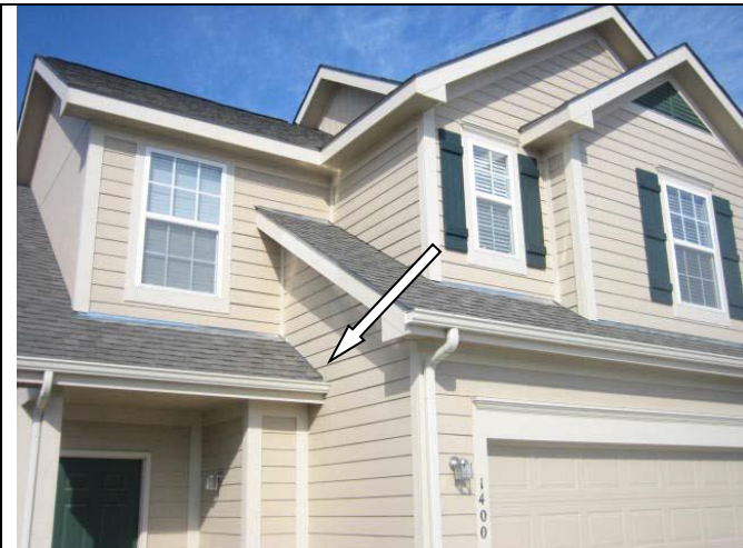
Typical location where a kickout is installed.

Water leaking between a gutter and the siding on a sidewall of a home can cause significant damage if not corrected. The problem can occur where a sidewall meets up with a roof and gutter in which one section of the home has a higher roofline. This is common on two story homes adjacent to garages, around chimneys, over front porches and a number of other locations. Water can leak between the gutter and siding. This can cause damage to the siding. In extreme scenarios it can damage interior walls, moisture and mold buildup on insulation, and even damage flooring if not corrected.