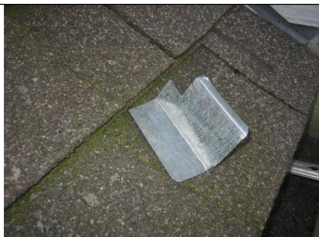
Notch cut in flashing to fit under overlapping siding.