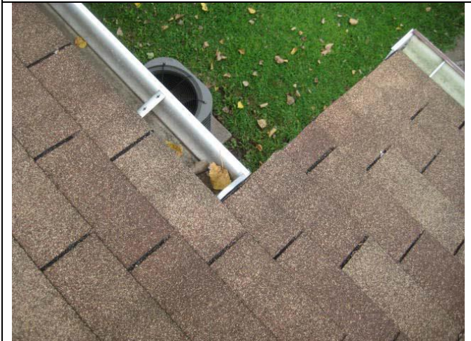
Overlapping roof location.