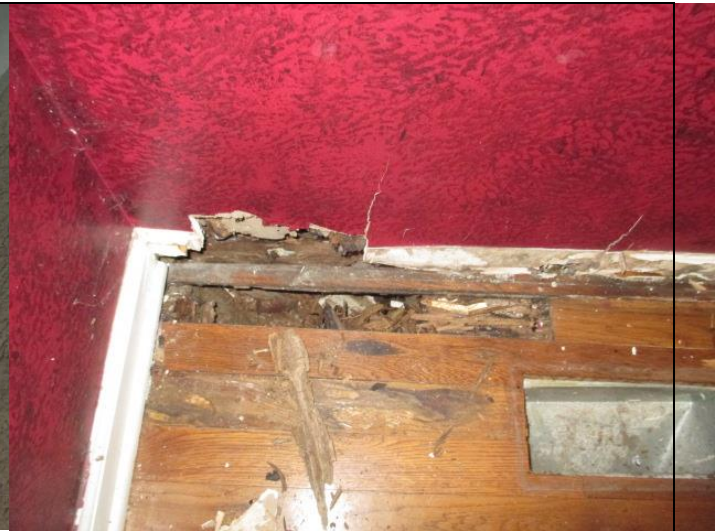
Damage to the interior flooring. The wall behind also showed significant damage.