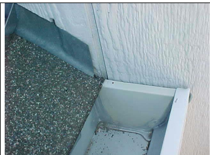
Typical kickout location with a higher roof line.