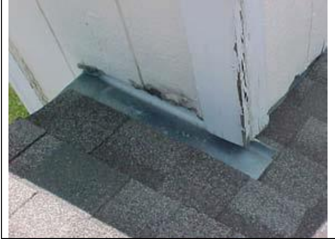
Damage to a chimney with flashing installed.