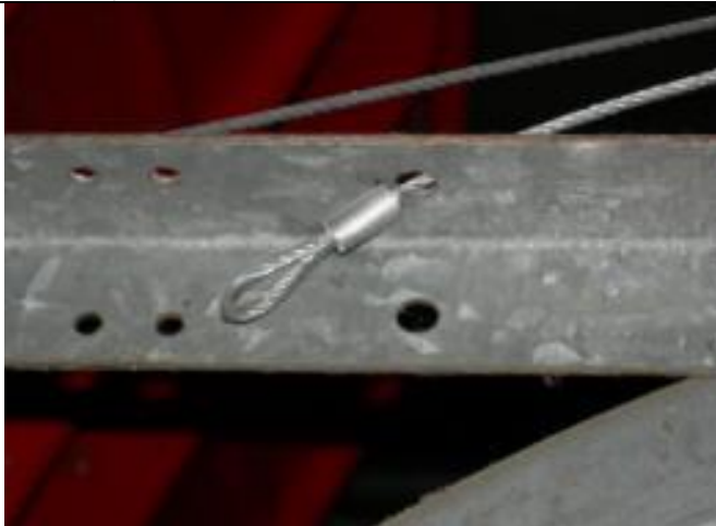
It is recommended to install the safety cable with the garage door open to limit tension on the helper spring. Attach one end of the safety cable near the stationary pulley.