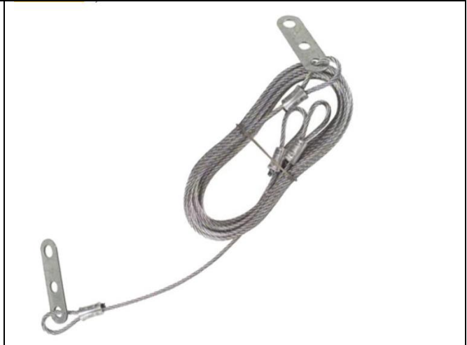
This is a kit you can purchase from your local hardware store.