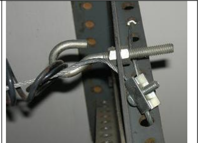
Thread the cable through the center of the helper spring and attach the other end to the garage door track mount.

The cable installation should be slack free and secured firmly at each end to prevent the spring from catching on the cable during door movement. After you have installed both safety cables, one through each spring, test the garage door. We recommend disengaging the motorized opener and testing by hand first. You can check for proper installation and ensure there is no binding.